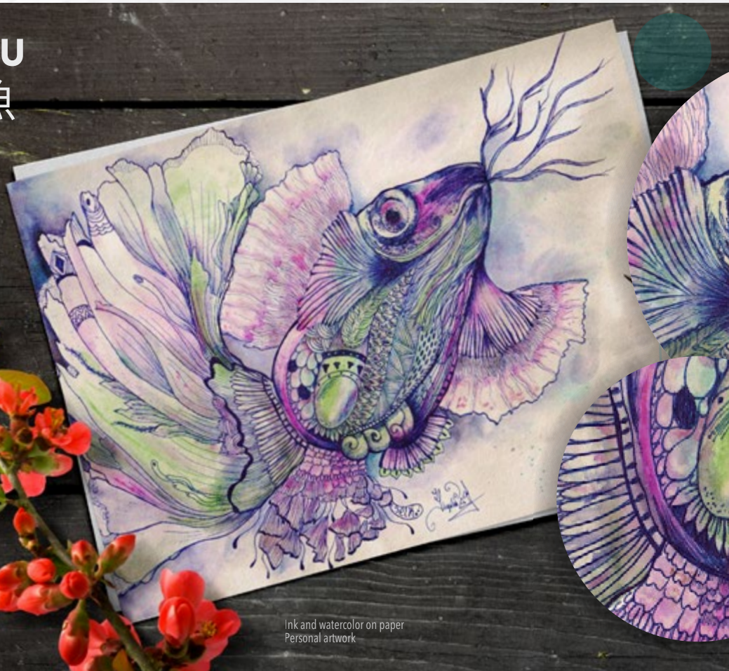
Ink and watercolor on paper Personal artwork